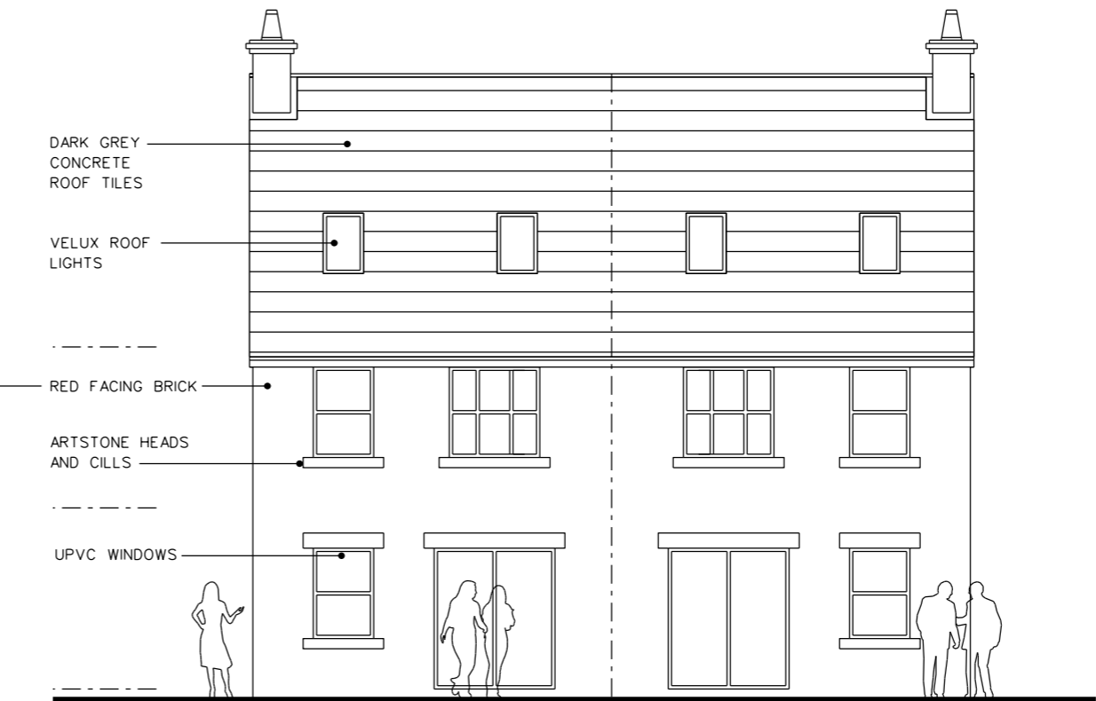
PROPOSED REAR ELEVATION (DWELLING 8-9)