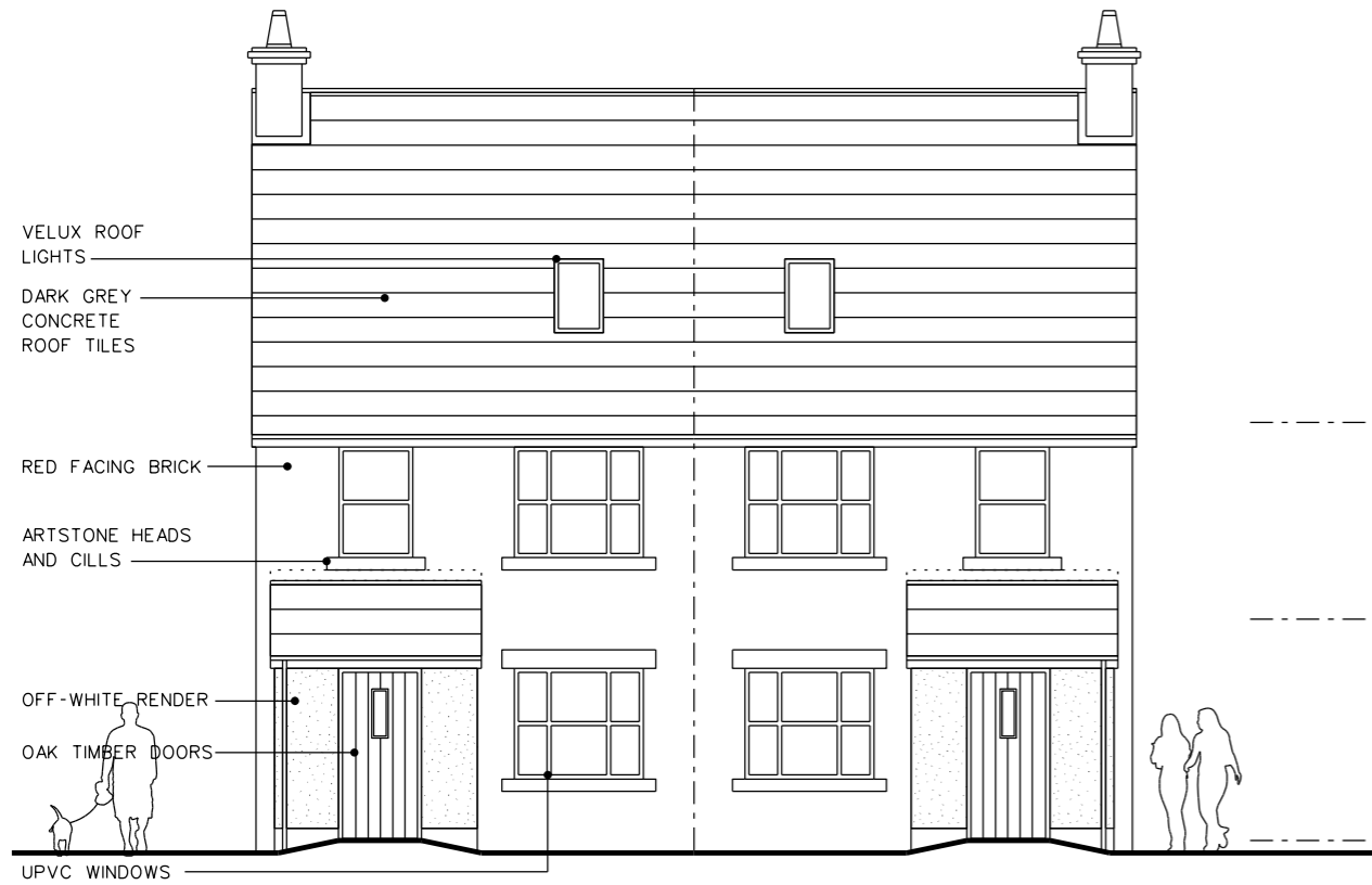
PROPOSED FRONT ELEVATION (DWELLING 8-9)